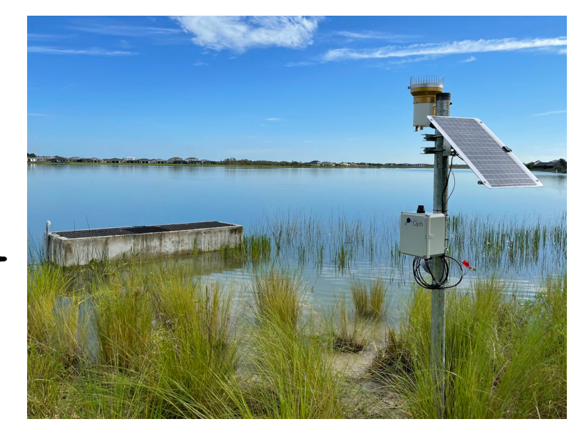
Smart Ponds are optimized for multiple benefits...